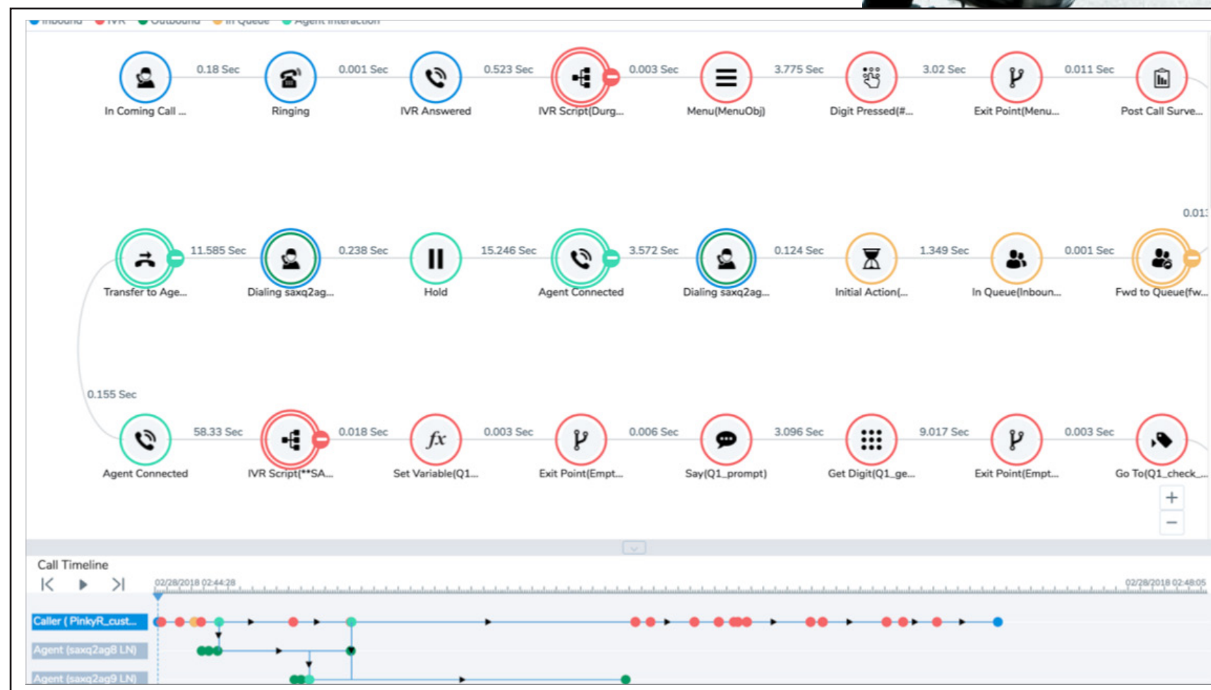
Customer journey mapping in 8x8 Customer Experience Analytics visualizes customer experiences.

visualizes the details and missteps of a customer engagement. Once you analyze the real sources of customer gratification and discontent, you can improve loyalty and boost advocacy.